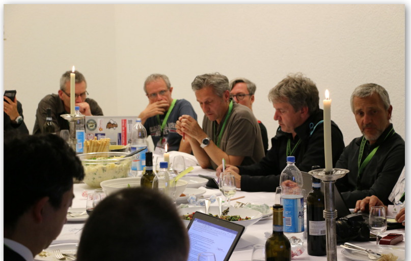
Abb. 4: Der Summit 2016 wurde während des Kongresses in Luzern (CH) im Rahmen eines Arbeitsessens abgehalten.

on all published contributions, and each Interpraevent member had the chance to discuss its point of view at a common dinner. A comprehension of this discussion with the central results and an outlook can be found in the annex of this business report.