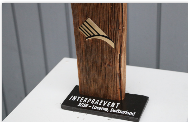
Abb. 1: Holzstele zur Erinnerung an den 13. Kongress in Luzern.

After 1992 an Interpraevent congress has for the second time been held in Switzerland and obviously it was of outmost interest for many, many experts: a record number of 586 participants from 16 nations participated in this congress. Compared to past congresses this is the highest number of participants ever.