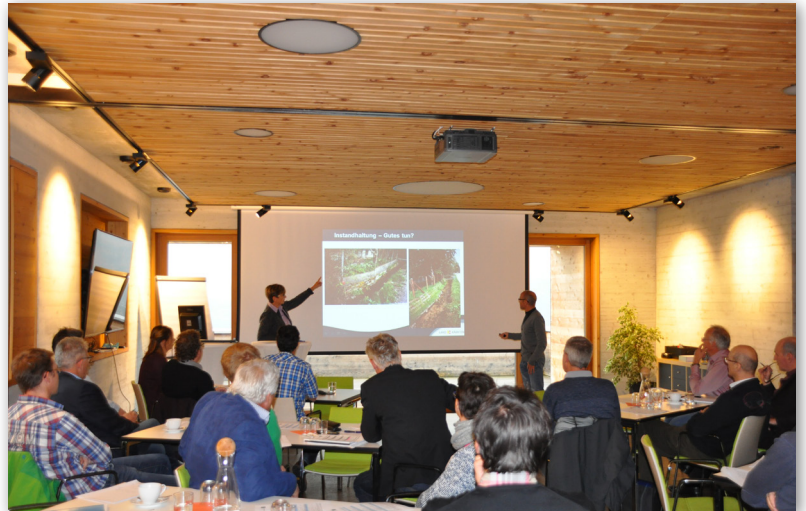
Abb. 6: Teilnehmer am Instandhaltung Workshop in Nussdorf bei Lienz.

Fig. 6: Participants at the "maintenance" workshop in Lienz (Austria).